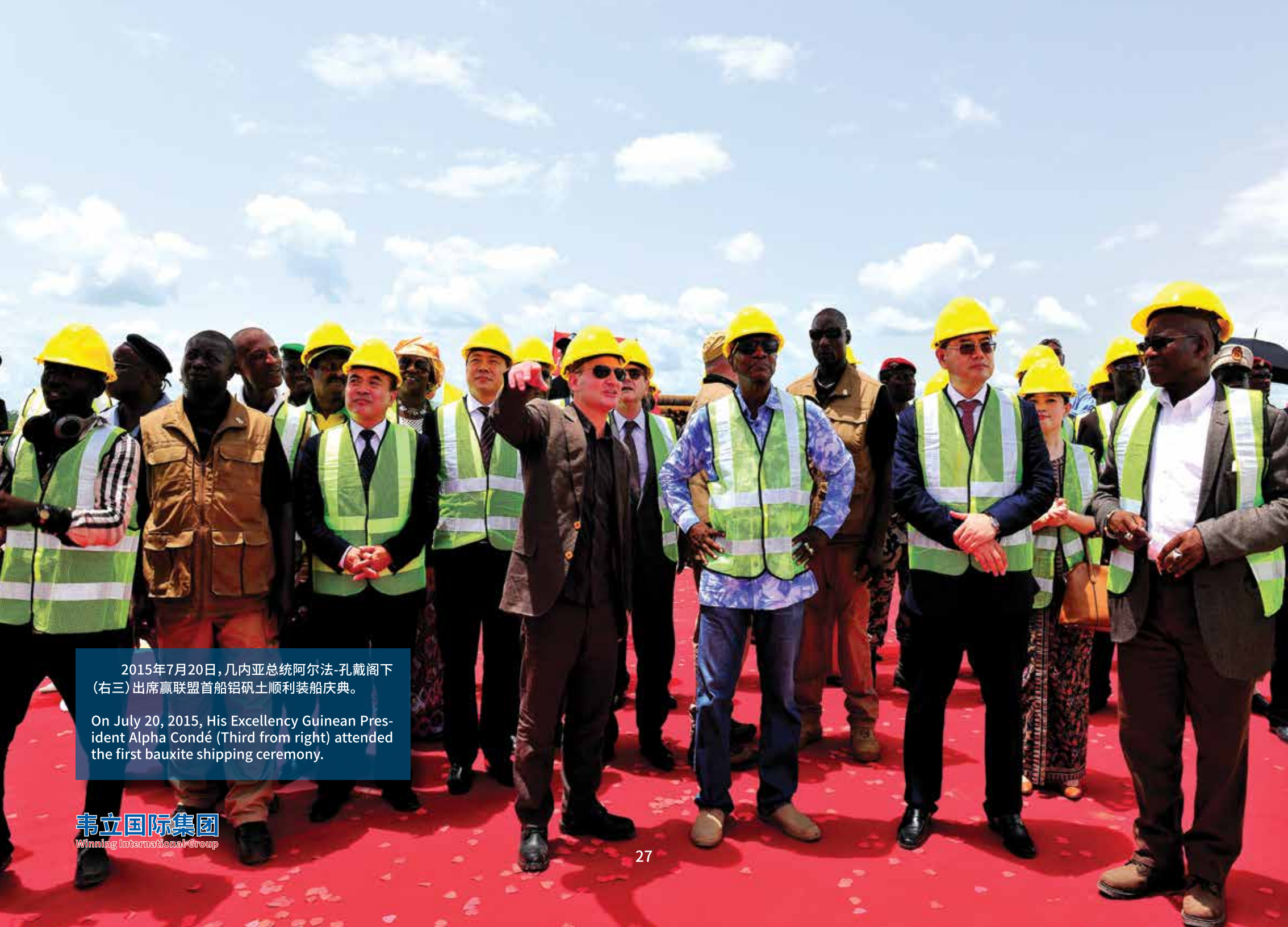
2015年7月20日, 几内亚总统阿尔法-孔戴阁下(右三)出席赢联盟首船铝矾土顺利装船庆典。 On July 20, 2015, His Excellency Guinean President Alpha Condé (Third from right) attended the first bauxite shipping ceremony.